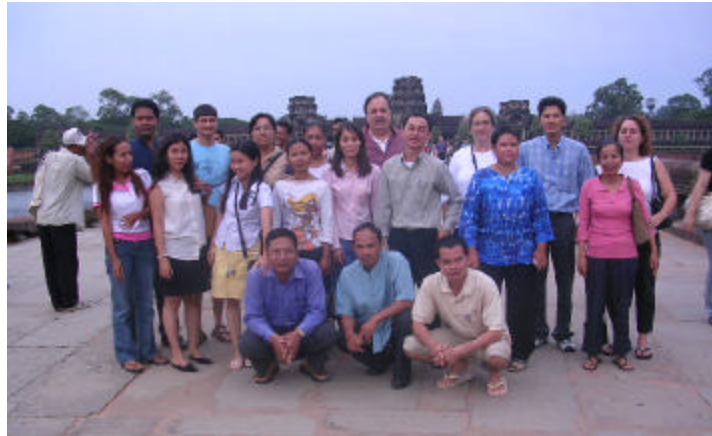
CCC Staff Retreat August 2005

The staff retreat held in Siem Reap in August was an opportunity for all staff members to reflect on CCC's activities and accomplishments during the year as well as to link the actions with the strategic priorities and objectives outlined in the CCC Strategic Plan.