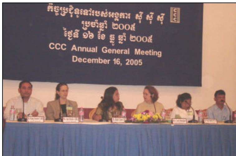
CCC Executive Committee 2005 at the CCC Annual General Meeting 2005