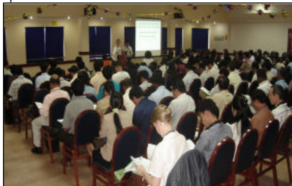
NGO GPP Consultative Feedback Meetings

Twenty-four Funding Agencies were invited to the NGO GPP Consultative Feedback Meetings on the draft Code of Ethical Principles and Minimum Standards for NGOs in Cambodia .