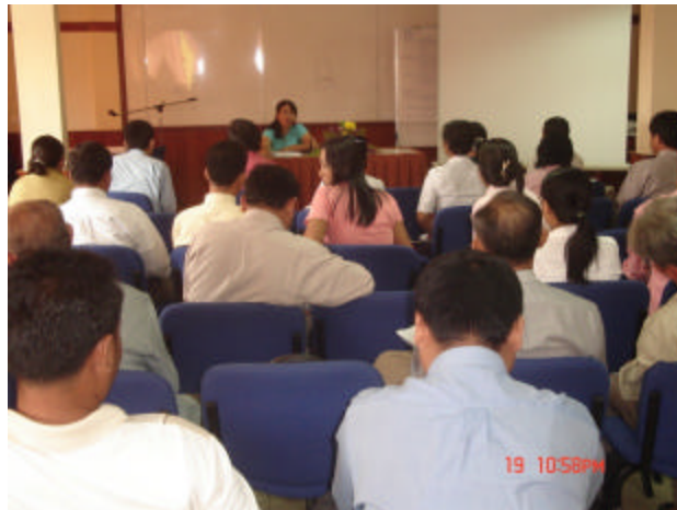
NGO GPP Focus Group Meeting

The NGO GPP team also made field visits to follow up with 18 of the Focus Group member NGOs and their target community groups to get feedback on the impact of the discussion sessions on the NGO practices in the field and in their organisation.