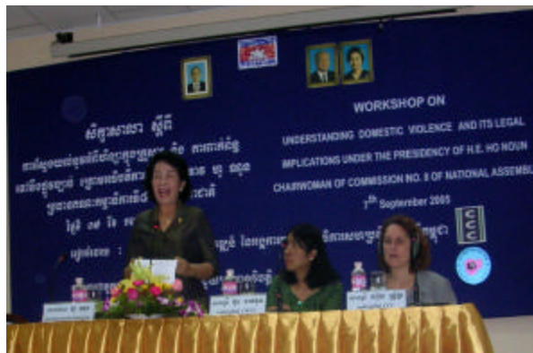
A Parliamentarian, CWCC and CCC Directors at ADI Project Issue Briefing on Domestic Violence

The Issue Briefing Workshops convened by the ADI Project are increasingly drawing more public attention. The workshop themes are now linked to the topic of the research studies conducted in the basic and advanced courses. Participation has been extended to include CCC Member Organisations, selected government and donor agency staff, interested individuals, along with the past ADI course participants.