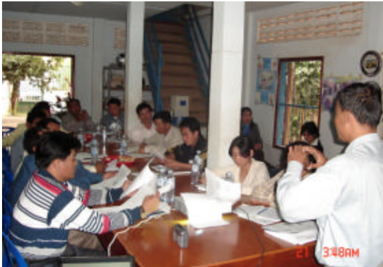
NGO GPP Presentation at Provincial NGO Network Meeting

would be most affected by participating in a NGO certification system based on compliance with the new Code.