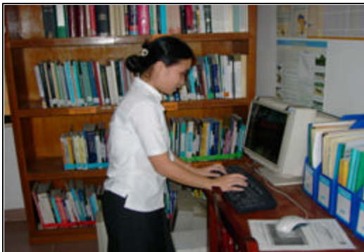
CCC Resource Centre – Documents and Searching the Document Database

The CCC Resource Center Library system was linked to the Internet and Internal Network early in the year, improving access to the library and making inquiries easier and faster to process. A new Library User Card system was initiated for non-CCC members, so for a small fee the general public can now loan books from the library.