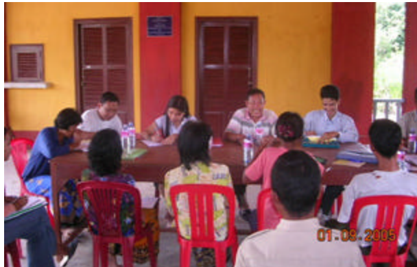
Field Visit during CCC Staff Retreat August 2005

We reviewed the CCC core values and strategic objectives and visited CCC member organisations project sites to better understand and reinforce the links with CCC work at the central level and the members activities in the field.