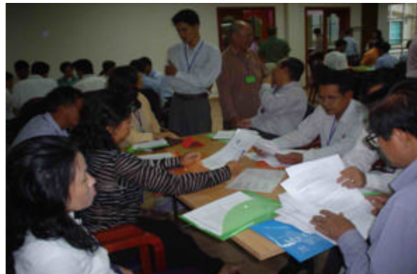
NGO GPP Consultative Feedback Meetings- Presentation and Participant Discussion Groups

The NGO GPP Consultative Feedback Workshops provided the participating government officials with an opportunity to learn from NGOs and to share their experiences with the 100+ NGO participants. The meeting was an important and effective awareness raising event on NGO Good Practices.