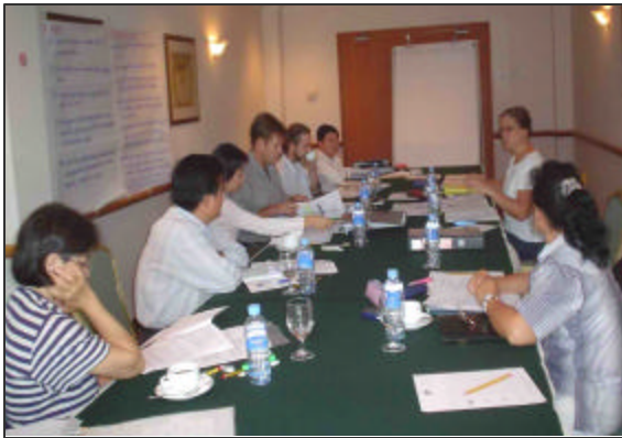
NGO GPP Working Group Meeting

The NGO Good Practice Principles Pilot Project aims to strengthen the NGO sector by encouraging and promoting NGO good practice principles and to foster the credibility and recognition of NGO contributions to development in Cambodia by donors, government and other civil society organizations.