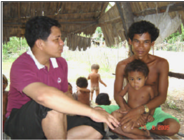
ADI Project course participant interviewing during field work in Kampong Thom

The theme of the advance course in 2005 was Rural Poverty: Understanding Social Networks in Response to Floods and Droughts . The participants undertook an empirical study in Kampong Thom province to link the micro experiences of villagers in social networking to macro trends in resource degradation and their expression in natural disasters. In the advance course participants were more involved in the preparation and design of the study, reviewing the relevant literature, conducting the fieldwork over a longer period of time, developing the analysis, and writing the final draft of the report.