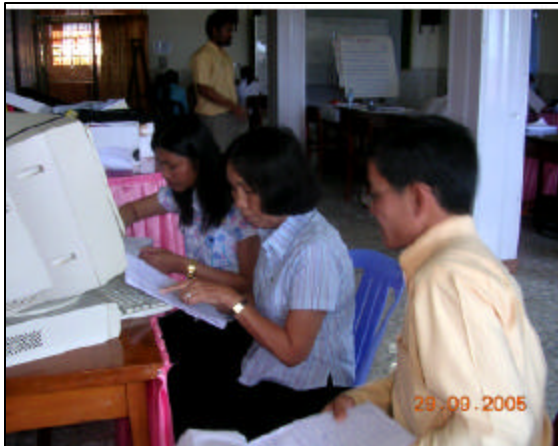
Participants improving their analysis in Disability Study

The ADI Project team completed three field research studies with training participants on important social and livelihood issues. The themes of the field study research for the basic courses in 2005 were Domestic Violence in a Rapidly Growing Border Settlement , with fieldwork conducted in Poipet, Banteay Meanchey province and The Challenge of Living with Disability in Rural Cambodia , with fieldwork conducted in Prey Veng province.