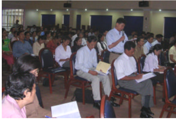
Participants at ADI Project Issue Briefing Workshop on Garment Industry

Over 300 participants from different NGOs, rural communities, garment factory workers, government departments, International Organisations and the private sector joined these events as presenters, discussants and participants.