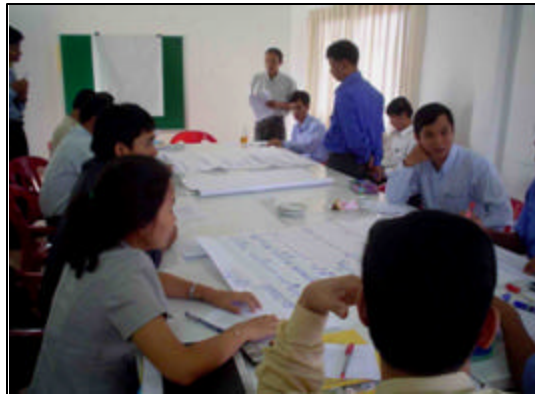
CCC Monthly Members Meeting – Small Group Discussion

CCC Monthly Members Meetings are organised as forums for information sharing on different development programs, special topics of interest and for discussion on issues raised by members.