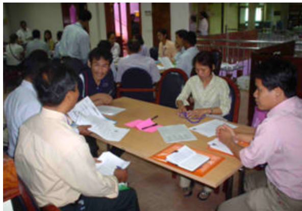
NGO GPP Consultative Feedback Meeting – Small Group Discussion

Two NGO GPP Consultative Feedback Meetings were conducted, in August and December, to present and discuss the draft Code of Ethical Principles and Minimum Standards for NGOs in Cambodia with the wider NGO community and other stakeholders, including representatives from the donor community and government departments.