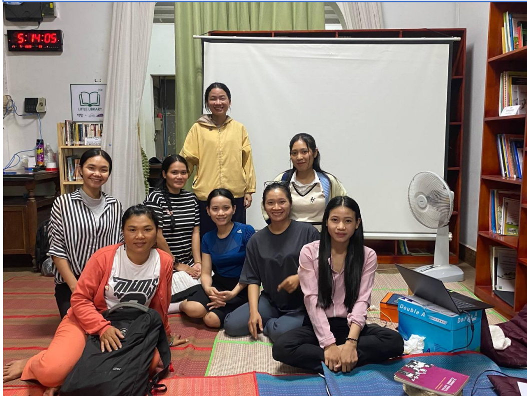
CIWA member fund committee meeting