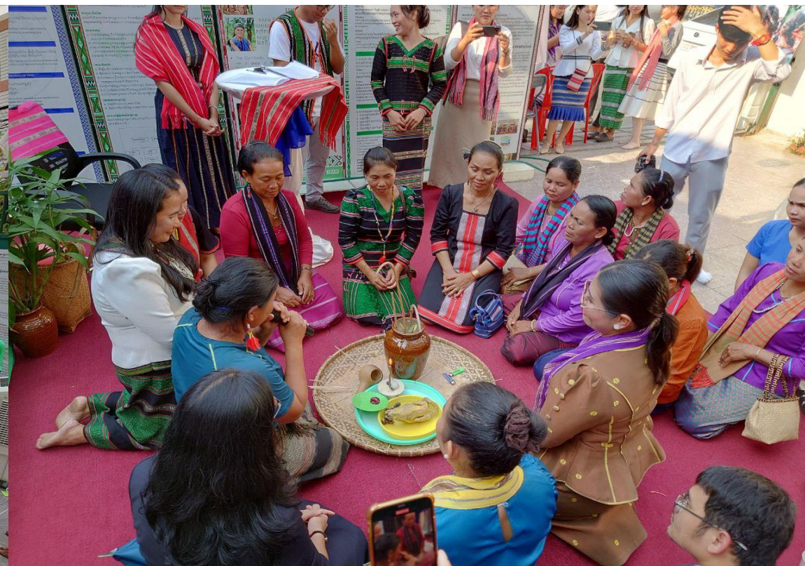
International Women Day