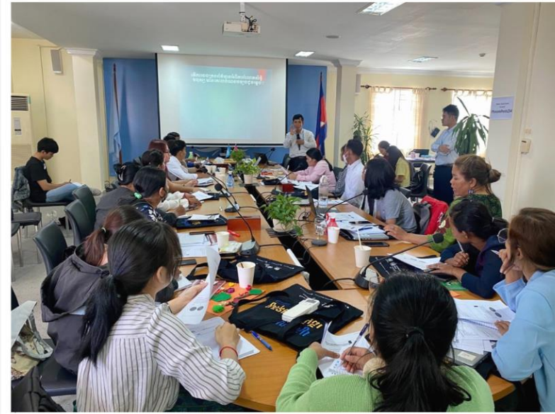
Training on women rights and Networking