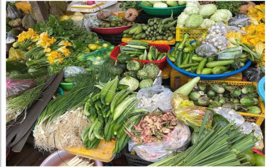
Business training and Indigenous product