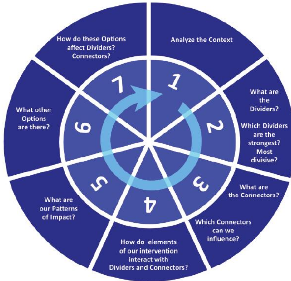
The Do No Harm Process