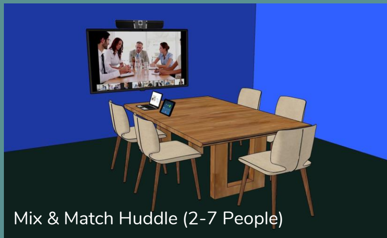
Mix & Match Huddle (2-7 People)