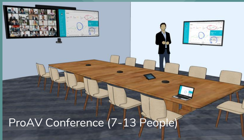
ProAV Conference (7-13 People)